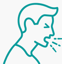
COUGHING OR WHEEZING